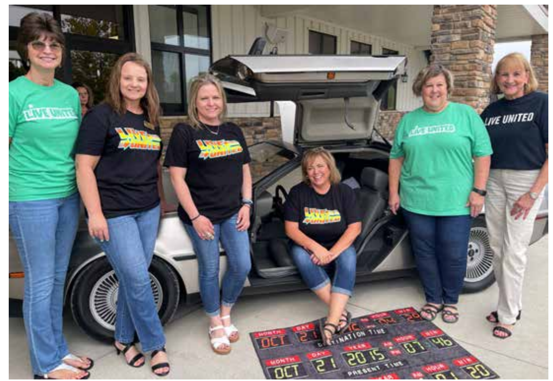
Representatives from MIB pose for a picture with the DeLorean at the United Way's Back to the Futurethemed Community Campaign Launch in September.