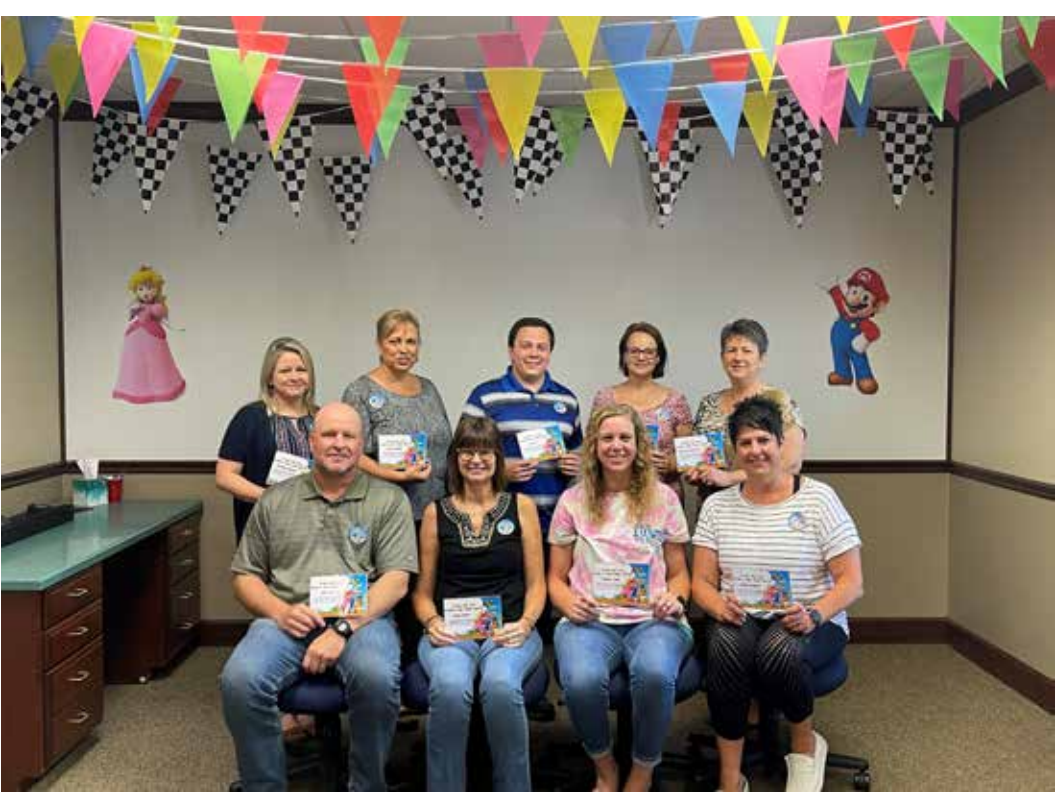
Employees at MIB were recognized for being 'Fair Share Givers' to the United Way – those who donated an hour of pay per month, or 1% of their annual salary.